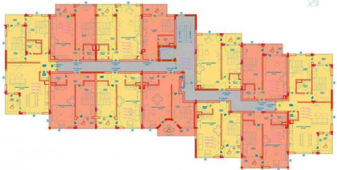
РАЗПРЕДЕЛЕНИЕ +3.45, +6.30,+9.15,+11.75