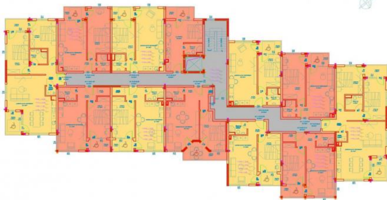
РАЗПРЕДЕЛЕНИЕ +3.45, +6.30, +9.15, +11.75